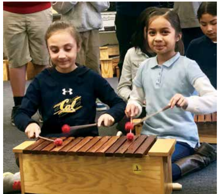
This page: Young Musicians at Jefferson Elementary Opposite (top-bottom): PUSD students participate in Music Mobile assemblies