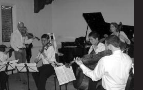
The Schubert Ensemble