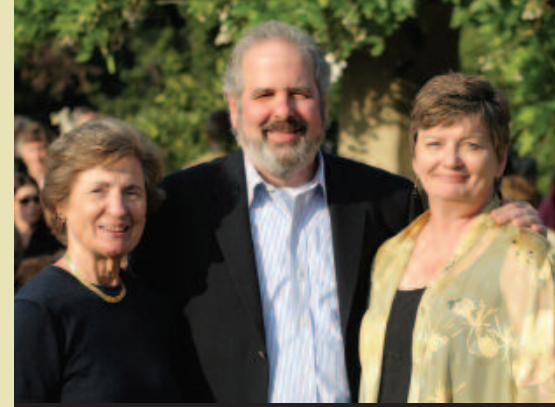
The grounds of the Culbertson House were a delightful oasis on a warm spring afternoon.